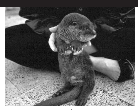
Neoptropical Otter Pup

With the development of an educational module for the otter exhibits, we hope to generate an impact on the community population that lives in the region and comes in contact with the otter, particularly the Neotropical species. We are developing printing material, focused on school groups and the indigenous community and planning special activities for Otter Days with the Environmental Regional Corporation (CAR). We hope this program