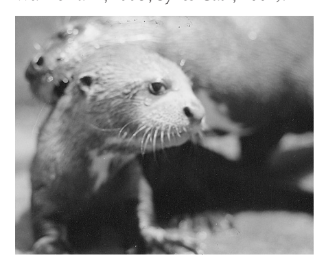
Giant otter mother picking up a pup by the scruff of the neck.