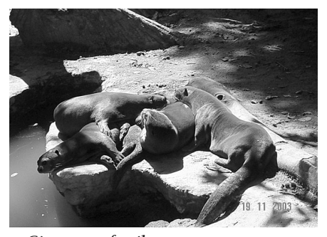
Giant otter family group, youngest pup in the middle

The male did not have much contact with the neonates during the first two months of their rearing, especially, on the occasions in which they were found in the company of the juveniles. He played an important role in the protection of the family, patrolling